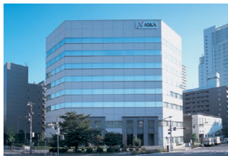
Head office in Tokyo

In its drive to become a women's healthcare pioneer, ASKA Pharmaceutical is committed to innovation and global expansion.