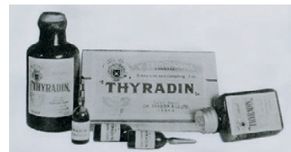
Drugs for the treatment of thyroid disease when launched in 1922

Three core areas with a focus on pharmaceuticals